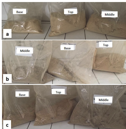
Fig. 2. Samples for chemical analysis of (a) C. melanoxylon ., (b) V. pauciflora , and (c) C. lanceolatum based on log axial direction.

Standard (SNI 08-7070: 2005). For chemical component analysis, the moisture content was determined using an oven which was set at a temperature of 105 \pm 3^\circ\text{C} for 24 h, and it ranged from 2-4% for lignin analysis, 3-6% for ethanol and benzene, and 1-2% for alpha-cellulose.