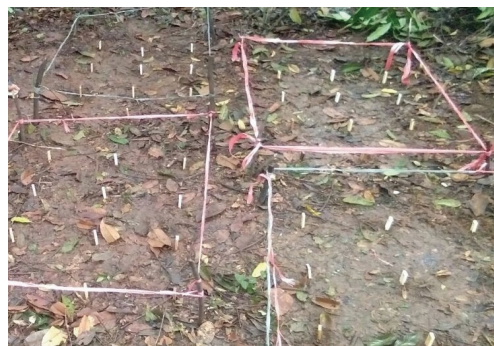
Fig. 1. In-ground testing of wood specimens.

where W_1 =weight of the oven-dried sample prior to the test (g), and W_2 =weight of the oven-dried sample after the test (g).