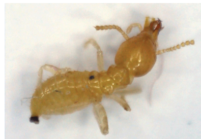
Fig. 2. Subterranean termite found in the arboretum.

Wood density affects how readily liquid can enter into wood tissue. Wood with a lower density is usually more easily penetrated by a monomer or chemical solution because there is more void space in its structure. In this study, the densities of sengon, jabon, mangium, and pine wood were 0.28, 0.34, 0.58, and 0.68 g/cm 3 , respectively. The MMA polymer loadings of sengon, jabon, mangium, and pine specimens were 27.88%, 24.91%, 14.14%, and 17.81%, respectively, and imidacloprid retentions were 7.56, 5.98, 5.34, and 9.53 kg/m 3 , respectively. The polymer loadings of MMA in this research was much lower than reached by Hadi et al. (2015), but the study was still carried out to know how much the resistance of MMA wood with this