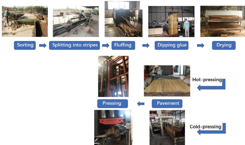
Fig. 2. Manufacturing of BFBCs with two pressing methods.

were totally impregnated in PF adhesive with a 12% solid content for 10 min. The moisture content in impregnated OBFMS was controlled at approximately 8%-10% via oven drying for 12 h. Then, the prepared materials were hot-pressed at 145°C at a rate of 1.0 mm/min. For cold pressing, the glued OBFMs were laid and pressed in a chamber (Fig. 2) and then were transmitted on the curing device for 14 h at 135 °C. The curing duration of manufacturing was 14 h. After completing the above processes, the obtained BFBCs were placed at ambient temperature for cooling. The BFBC density was determined by measuring its air-dry weight and volume after the composites were kept in a conditioning room with a relative humidity of 65 ± 3% at 25 °C ± 2 °C for 2 weeks. After measurement, the samples with exact densities of 1.0, 1.1, and 1.2 kg/m 3 were selected for evaluating properties.