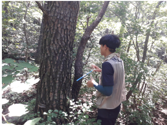
Fig. 2. Extracting an increment core (Ø5.15 mm) from an experimental tree ( Pinus densiflora ) at chest height.

annual ring analysis, according to the number of rings. The samples were extracted bidirectionally at chest height, where the wood could be avoided, using an increment borer (Fig. 2 and Table 1).