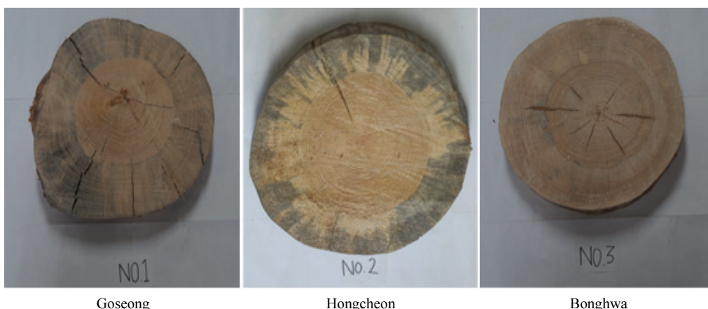
Fig. 1. Disks from each province.