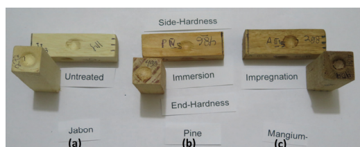
Fig. 3. Side- and end-hardness tested wood specimens: (a) untreated jabon, (b) MMA immersed pine, and (c) MMA impregnated mangium.

As shown in Table 7, wood species, treatment and interaction between wood species and treatment factors are shown to have affected mechanical properties of the wood, but the interaction factor did not significantly affect end hardness. According to Table 6, the mech-