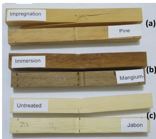
Fig. 2. MOR-MOE tested wood specimens: (a) MMA impregnated pine, (b) MMA immersed mangium, and (c) untreated jabon.

** Highly significantly different ( P \leq 0.01 ); NS, not significantly different.